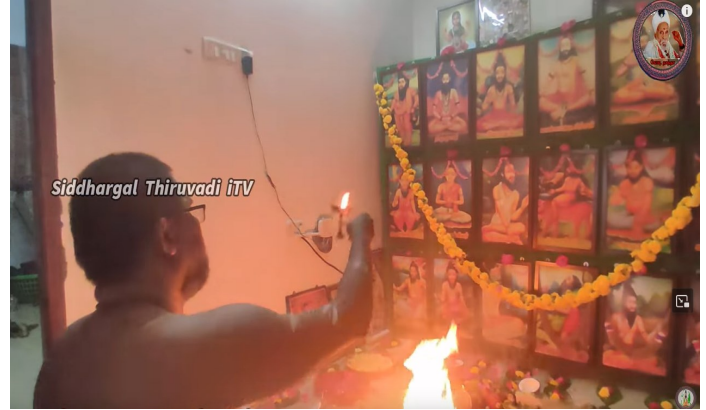
Picture-8 : Conducted "18 Siddhar Yaaga Pooja" for World Peace on every Lunar dates at Chennai

Siddhargal Thiruvadi Seva Trust hosting special "Holy Yaaga Poojas" for the 18 Siddhars to foster global peace, observed during significant lunar phases (Full Moon and Off Moon).