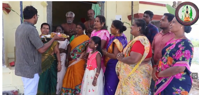
Picture-3 : Providing one month Oil and Abhishek items to Sri Vaaleswarar Tempke , Siththukadu, Thiruvallur Dt

This tradition, deeply rooted in Hinduism, fosters continuity and connection with the past. It transcends cultural and regional boundaries, uniting devotees in a shared spiritual practice.