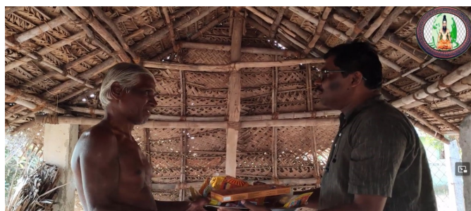
Picture-4 : Providing one month Oil and Abhishek items to Sri Thandavamoorthy Siddhar Jeeva Samadhi, Amuthurmedu, Thiruvallur—Dt

Siddhargal Thiruvadi Seva Trust has observed that many Siddhar Jeeva Samadhis in Tamil Nadu lack the means for daily lighting and remain in darkness. Some are even without a proper structure. To address this, the Trust has committed to providing oil and Abhishek items for a month or a specific duration to ensure these sacred sites are properly maintained.