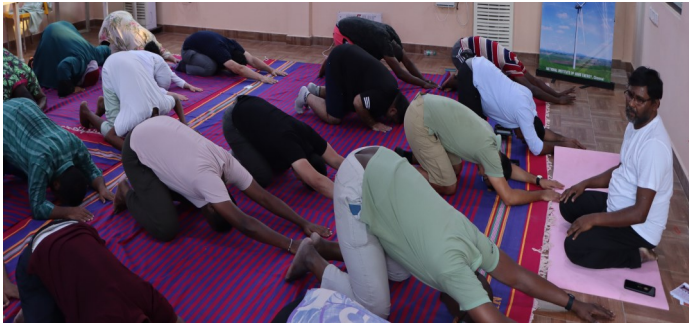
Picture-5 : Conducting one-day Training Programme on "Everyday Yoga Practices" on Yoga Day 20th June, 2023

Siddhargal Thiruvadi Seva Trust hosting special "Holy Yaaga Poojas" for the 18 Siddhars to foster global peace, observed during significant lunar phases (Full Moon and Off Moon).