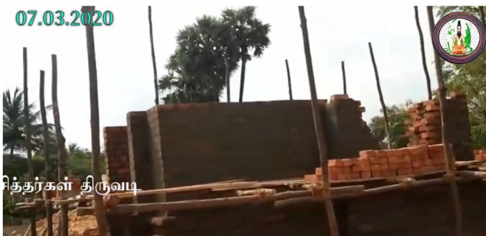
Picture-2 : Construction Materials Provided to Adh Kailasanathar Temple at Ponneri, Thiruvallur District

Temple renovation, reconstruction, and Kumbabhishekam are considered highly noble deeds. We should all contribute in any way we can to earn “Punya Karma”. Even a small offering, such as a brick, sand, cement, stone, statue and shivlinga contributes to our spiritual merit, as it ensures our presence in “Kailash or Vaikuntha” for as long as the brick / stone remains in the temple. Assisting the needy in marriage and performing “Shiva Puja” with offerings is also seen as very noble. The offerings can be as simple as a fruit, flower, or camphor, but the spiritual rewards are significant. Since 2020, Siddhargal Thiruvadi Seva Trust has been engaged in such holy activities, providing financial assistance and materials for eligible temple renovations or re-constructions.