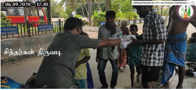
Picture-7 : Food and Water provided during COVID-19 Pandemic at Stanley Hospital, Chennai